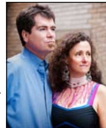
Fundraising Concert on May 20

Bring your family, friends and neighbors for this special treat at Calvary